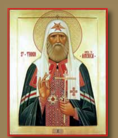
St. Tikhon, Patriarch of Moscow, Founder of St. Tikhon's Monastery 1905